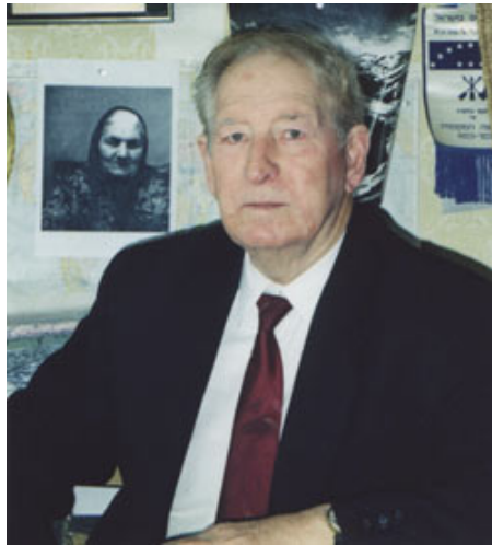
Asker Hedeghel'e is an iconic researcher and folklorist.

It is markworthy that after World War II the Circassian and Ossetic versions of the Epos were withdrawn for some time for 'treatment' and removal of 'elements of an ideology foreign to the people.' (V. Astemirov, 1959, p94)