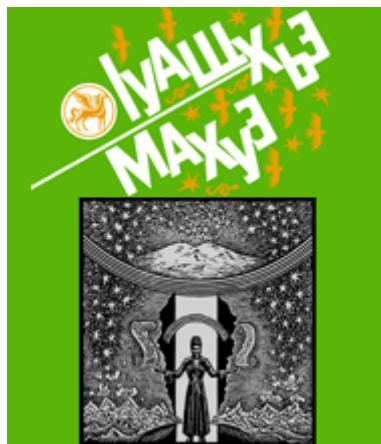
The emblem of the ' Waschhemaxwe («Иуашхьэмахуэ»; Mount Elbrus) Journal. The spread of literacy in Circassian amongst the diaspora Circassians would boost the circulation of the literary outputs in the Caucasus.

The literary and cultural almanac Qeberdey («Къэбэрдей»; 'Kabarda') was the organ of the Union of Soviet Writers of Kabarda. It was published in Nalchik starting from 1948 in Kabardian. The most prestigious and influential literary journal is ' Waschhemaxwe («Иуашхьэмахуэ»; Mount Elbrus), published by the Union of the Writers of the Kabardino-Balkarian ASSR. The first issue of the monthly came out in 1958. The journal also deals with historical and artistic matters. Since 1991, it has been published by the Union of the Circassian Writers of the Kabardino-Balkarian Republic once every two months. Less than 3,000 copies of each edition of the Journal are published. Thenceforth, taboo subjects were forcefully breached. Literary Kabardino-Balkaria was the Russian language organ of the Union. All these journals, Nur included, were subsidized by the government. All writers were members in the Union and were paid salaries.